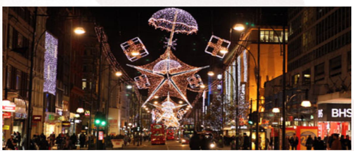
'Oxford street' London UK (2011) light's

Cities are decorated with Christmas lights. Famous people switch them on. The most famous Christmas lights are in 'Oxford Street' in London. Every year they get bigger and better. Thousands of people go to watch the big 'switch on' around the beginning of November. Trees are often real decorated fir-trees.